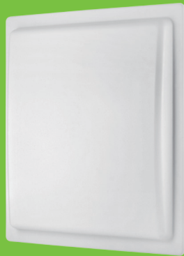
UHF 10 series