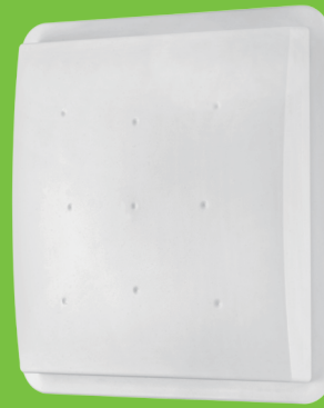
UHF 5 series