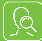
Touchless for Better Hygiene