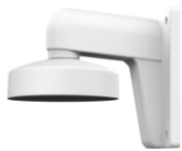
DS-1272ZJ-110-TRS Wall Mounting Bracket