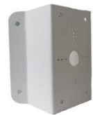
DS-1276ZJ Corner Mounting Bracket